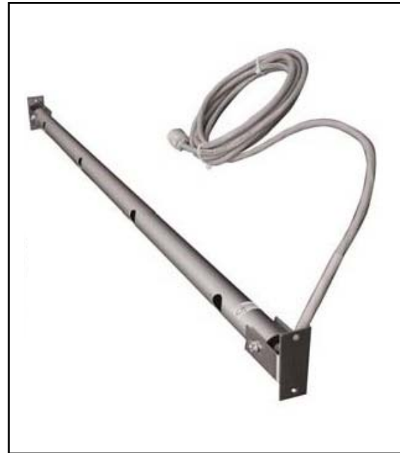
Figure 1. Internal Mount Probe

brackets. For detailed probe information, refer to the Duct/Plenum Probe technical manual under separate cover. For detailed information on transmitter set up and operation of the complete airflow measurement station, refer to the associated transmitter technical manual under separate cover. Observe the following installation precautions: